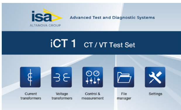
Main Menu Display